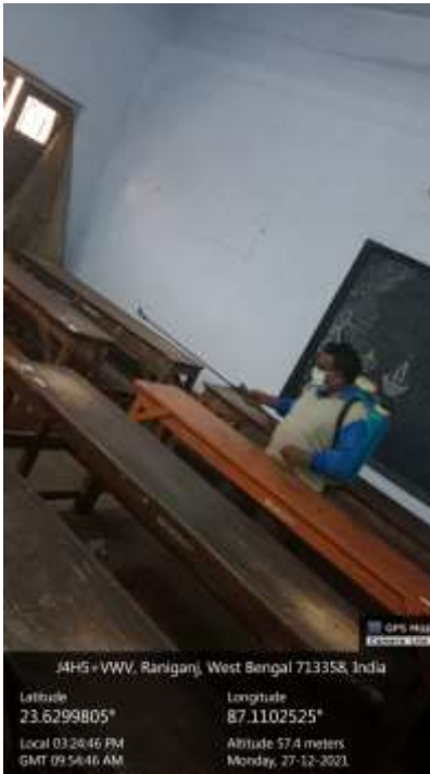
Regular Sanitization in progress