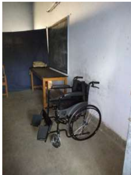
Facilities for Sick Room