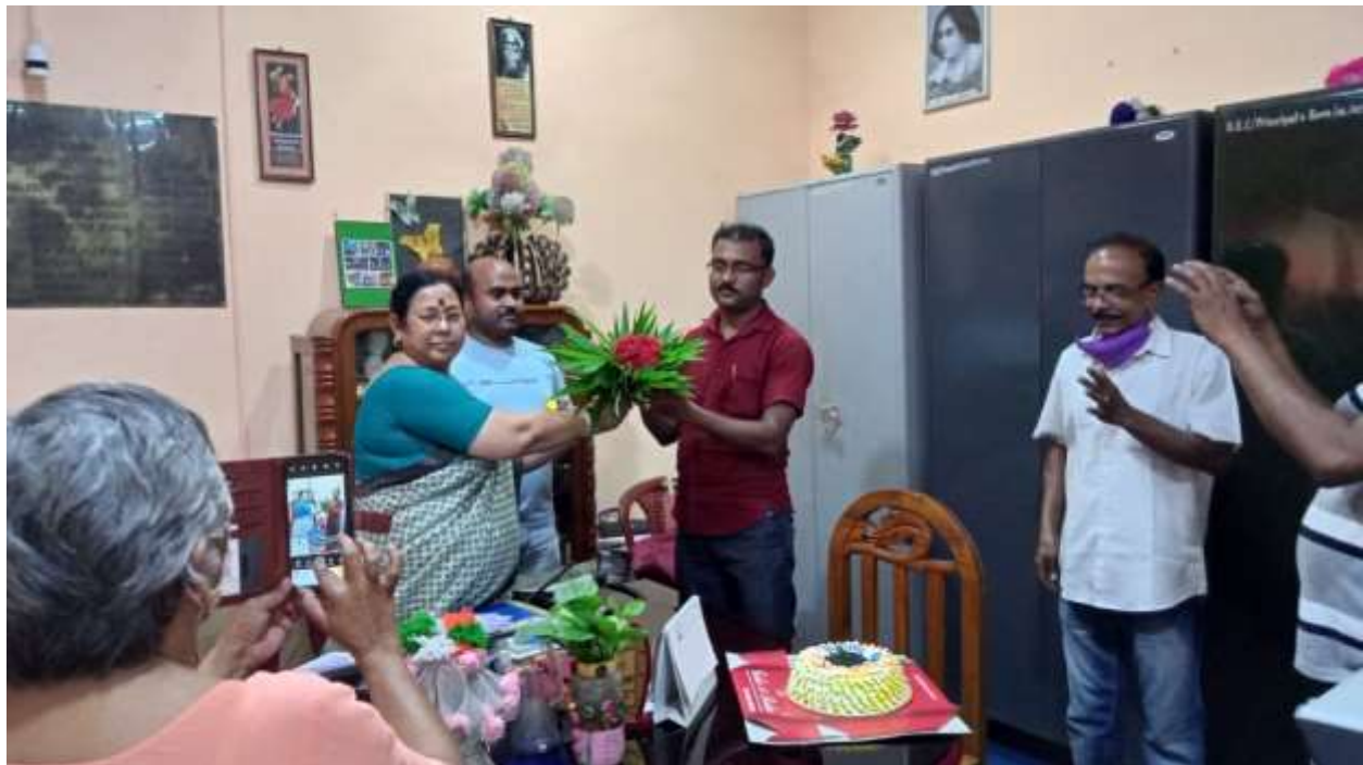
Celebration of Birthday of incumbent